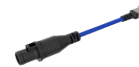
GRWT类型协议转换器母头/GRWT类型协议转换器公头 Agreement Adaptor Female for GRWT Type / Agreement Adaptor Male for GRWT Type