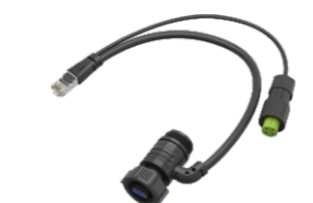
HW型协议转换器母头/HW型协议转换器公头 Agreement Adaptor Female for HW Type / Agreement Adaptor Male for HW Type