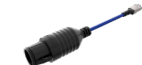
SH型协议转换器母头/SH型协议转换器公头 Agreement Adaptor Female for SH(new) Type / Agreement Adaptor Male for SH(new) Type